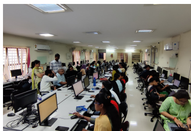
Hands on @Training Hall