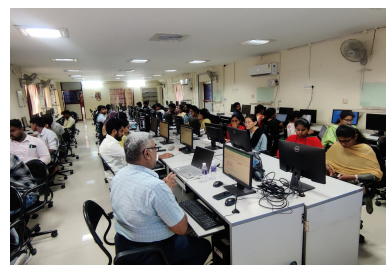
Hands on @Lab 1