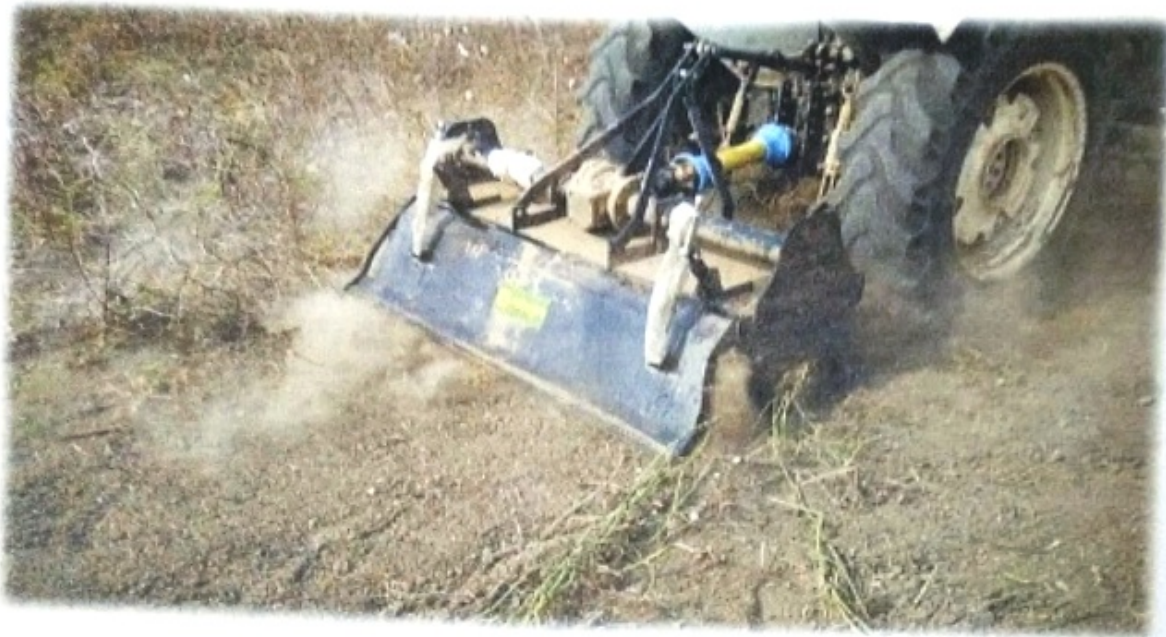
Fig.4. Field Trial (a)