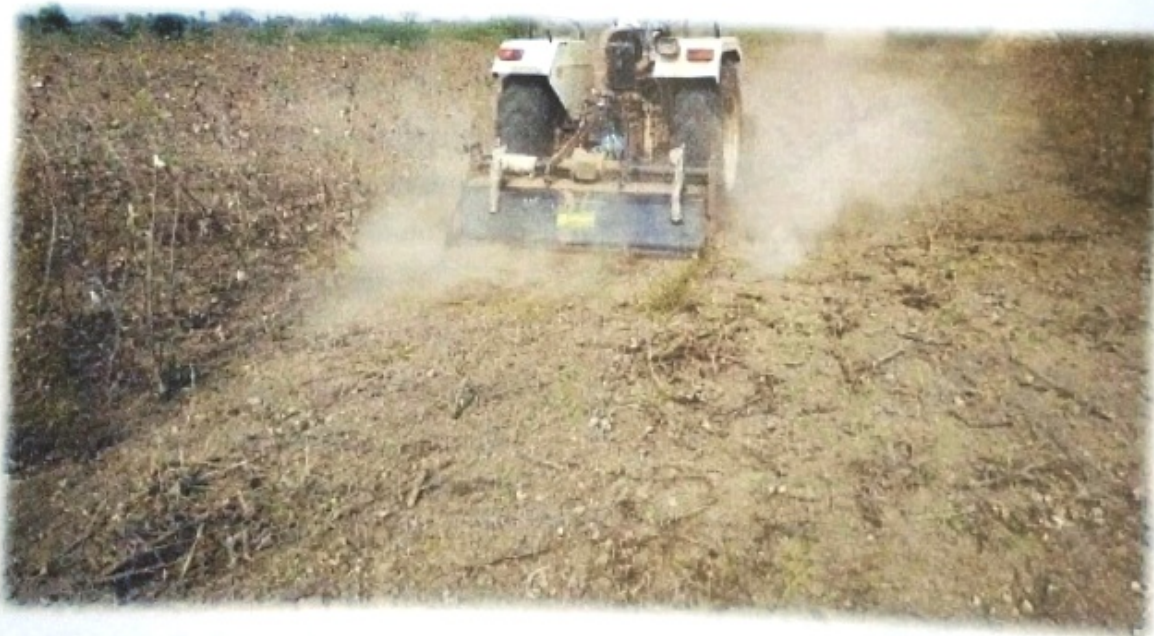
Fig.5. Field Trial (b)