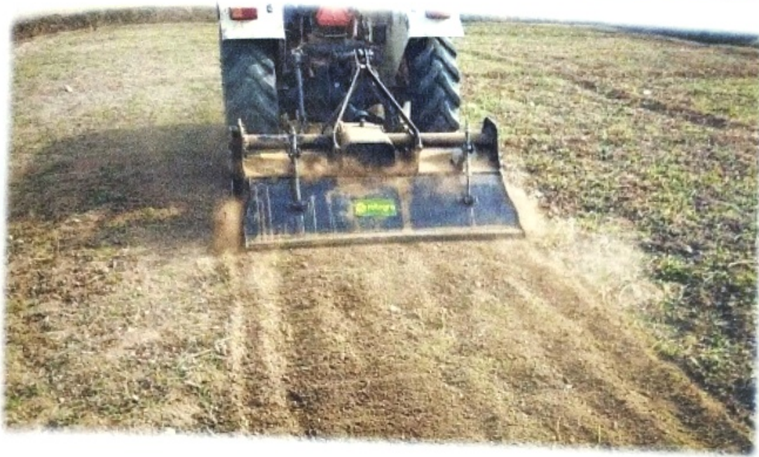
Fig.4. Field Trial (a)