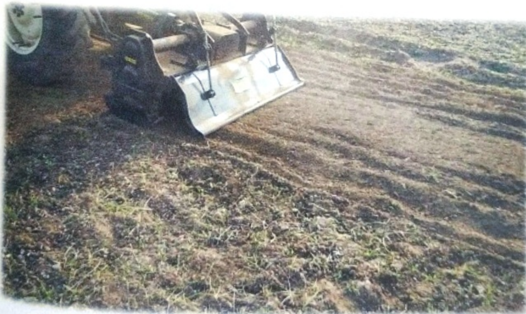
Fig.5. Field Trial (b)