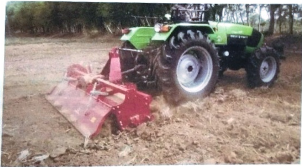
Fig.7. Field Trial (b) – Dry land