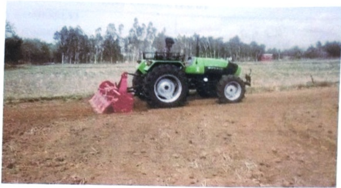
Fig.6. Field Trial (a) – Dry land