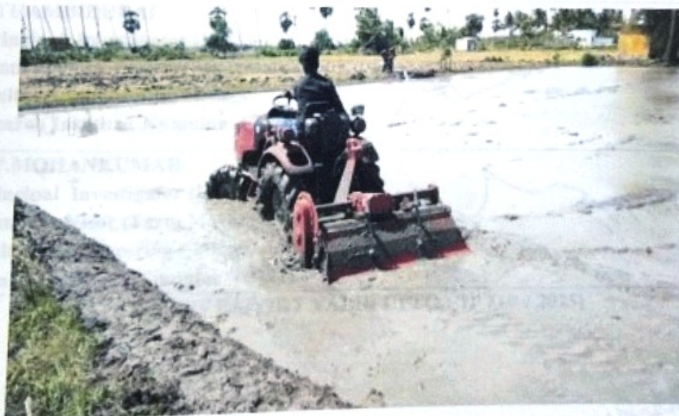
Fig.7: Field Trial – wet land