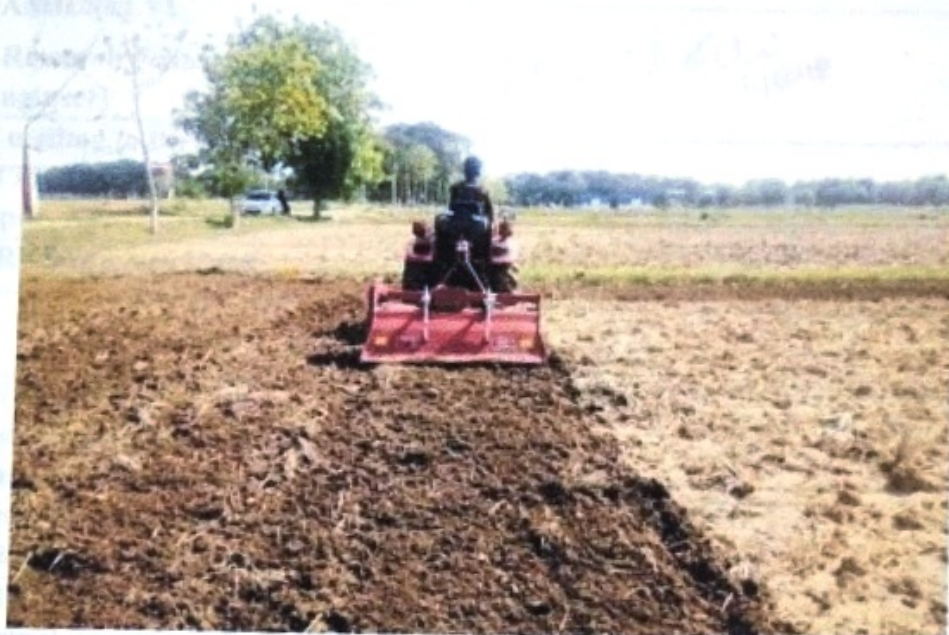
Fig.6: Field Trial – dry land