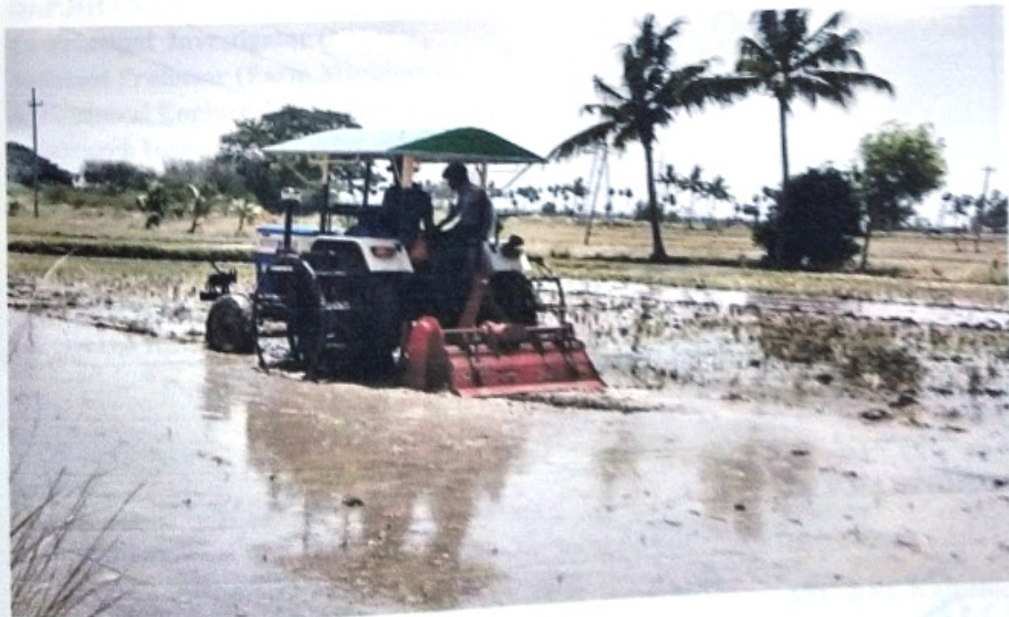
Fig.7. Field Trial (b)-wet land