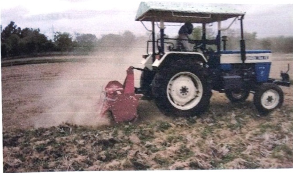
Fig.6. Field Trial (a)-Dry land