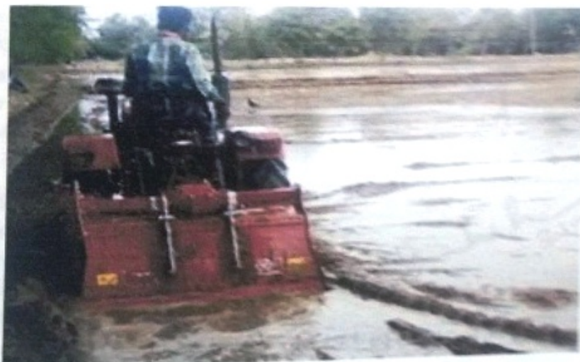
Fig.7. Field Trial – wet land