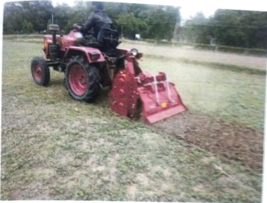
Fig.6. Field Trial – dry land