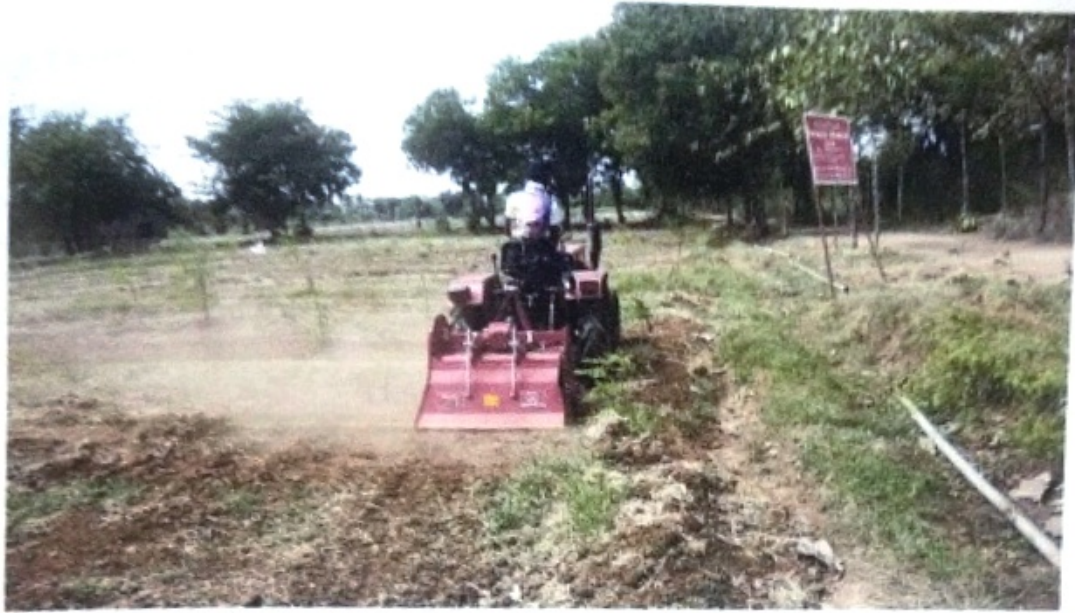
Fig.6. Field Trial - dry land