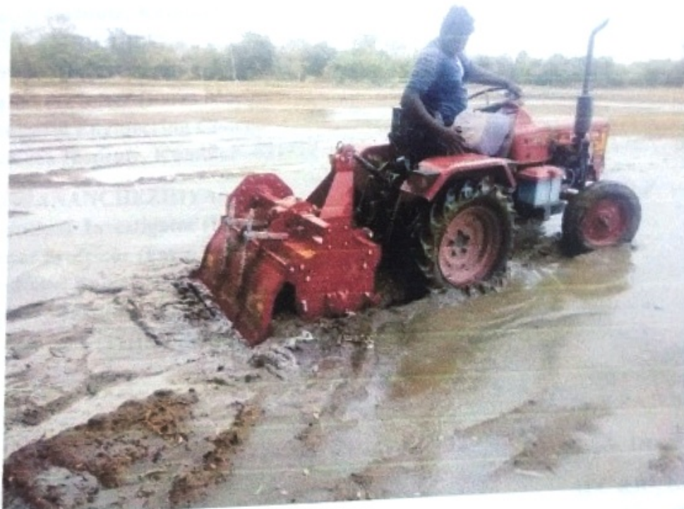
Fig.7. Field Trial - wet land