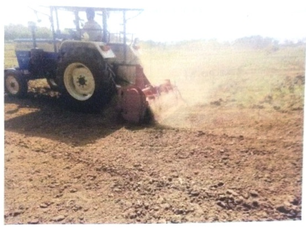
Fig.6. Field Trial (a) - Dry land

TAFE AGRISTAR 917 V - 54 BLADE MULTI / SINGLE SPEED ROTARY TILLER