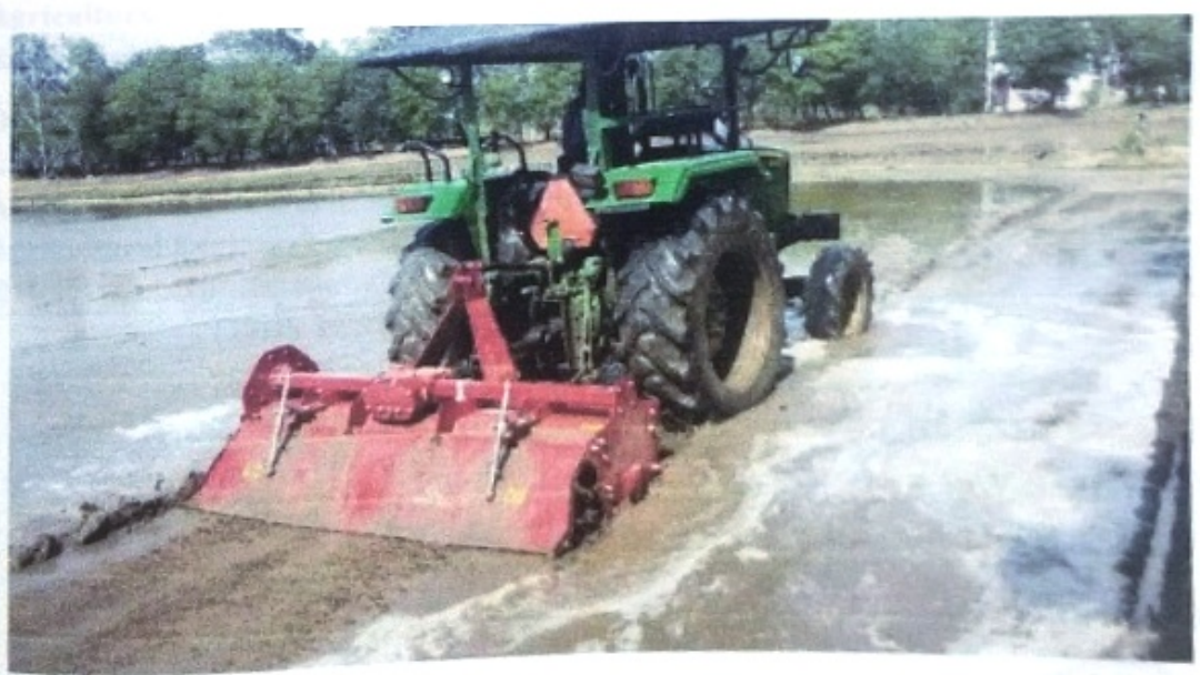
Fig.7. Field Trial (b) - wet land

FARM MACHINERY TESTING CENTRE AGRICULTURAL ENGINEERING COLLEGE & RESEARCH INSTITUTE, TNAU, KUMULUR