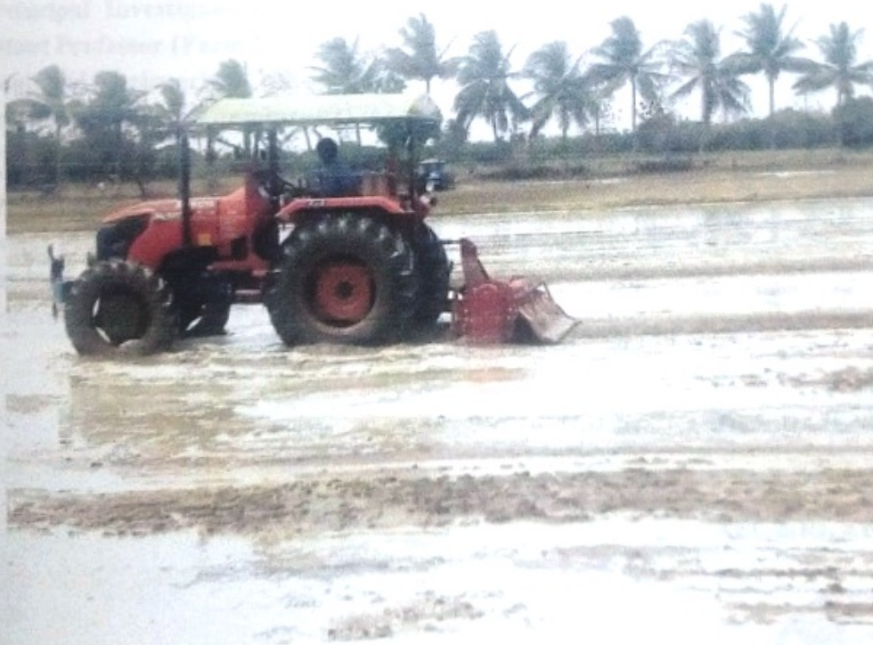
Fig.7. Field Trial (b) – wet land