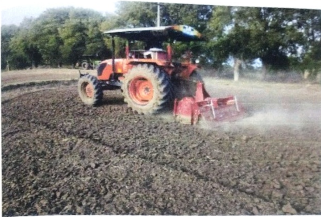
Fig.6. Field Trial (a) – Dry land