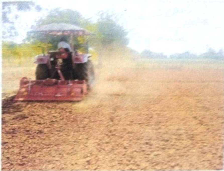
Fig.6: Field Trial – Dry land