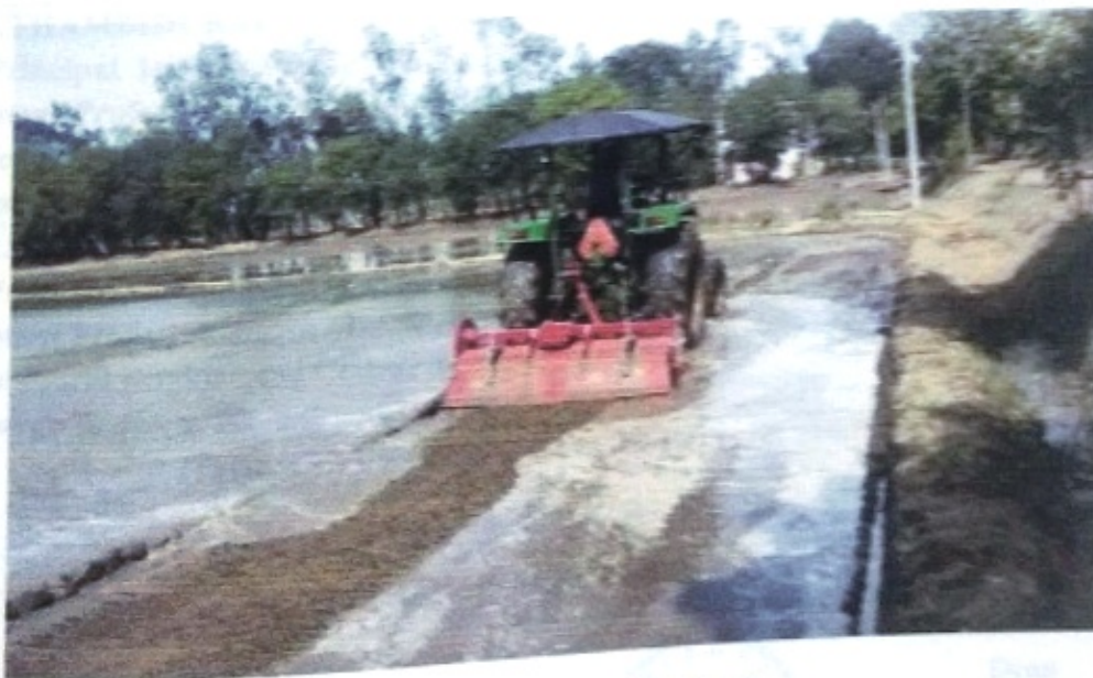
Fig.7: Field Trial – Wet land