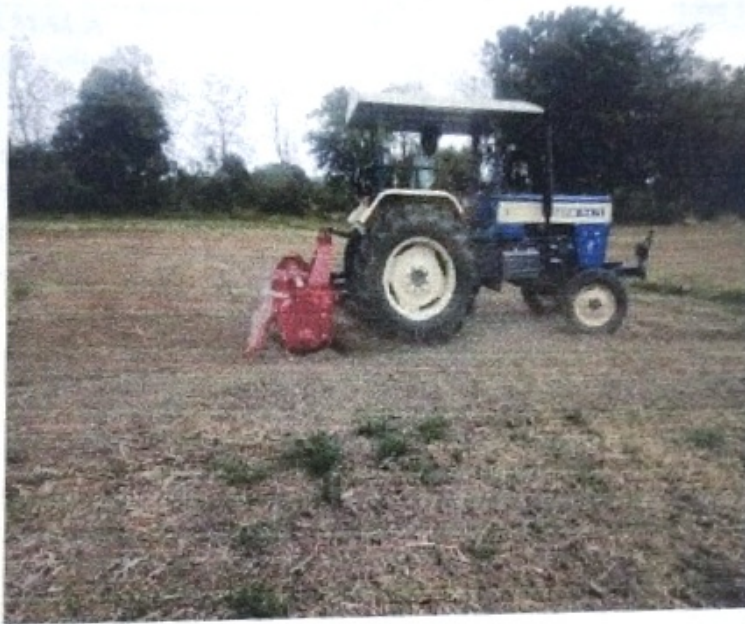
Fig.6: Field Trial (a) – Dry land