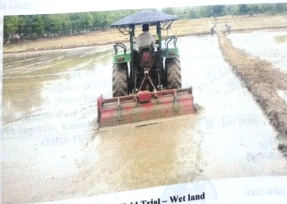
Fig.7: Field Trial – Wet land