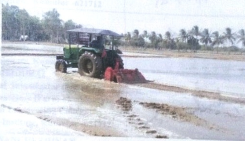
Fig.7: Field Trial – Wet land

(THIS TEST REPORT VALID UP TO 23/10/2018)