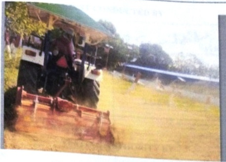
Fig.6: Field Trial (a) – Dry land