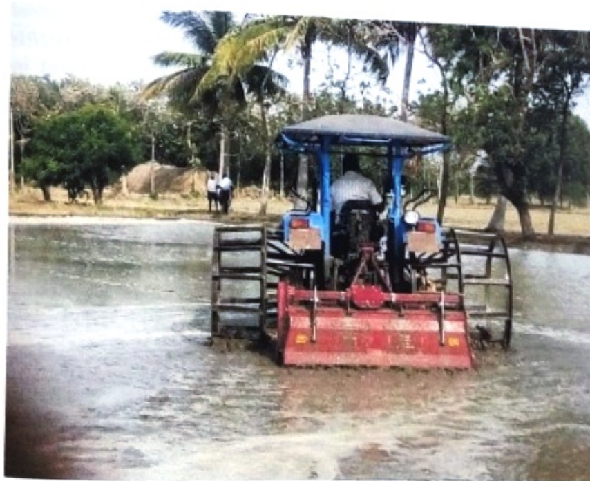
Fig.7: Field Trial (b) – Dry land