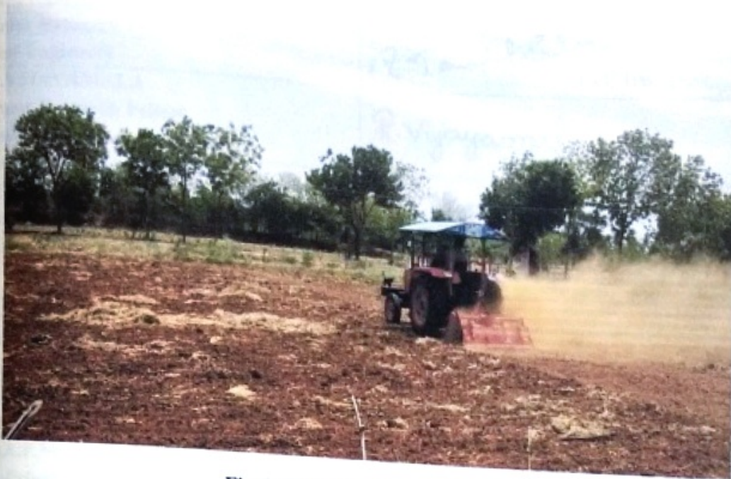
Fig.6: Field Trial (a) – Dry land