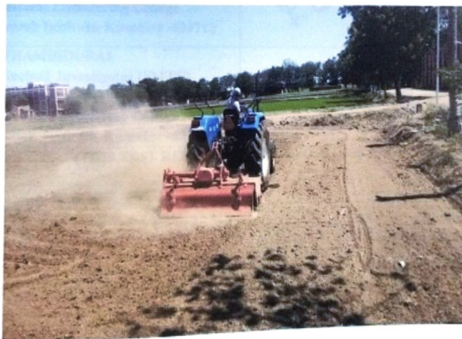
Fig.7: Field Trial (b) – Dry land