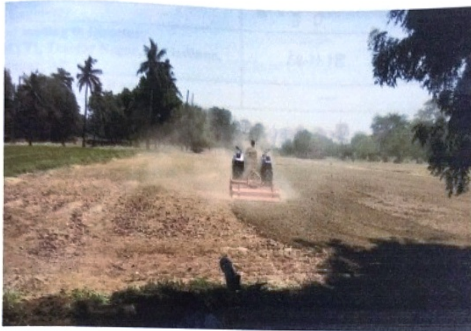
Fig.6: Field Trial (a) – Dry land