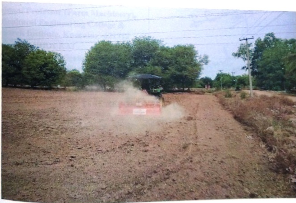
Fig.7. Field Test (b) – Dry land