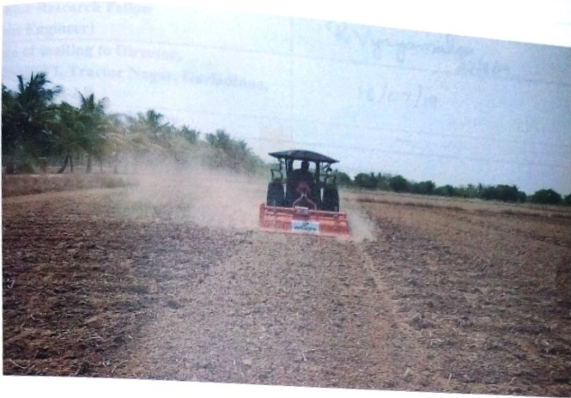
Fig.6. Field Test (a) – Dry land