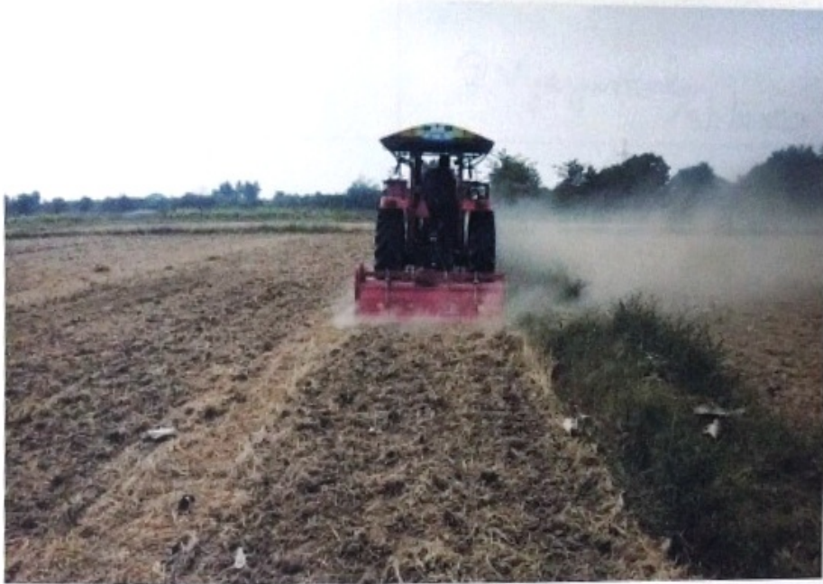
Fig.6. Field Test (a) – Dry land