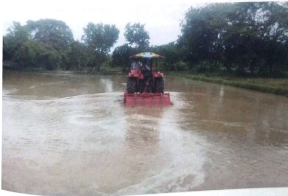
Fig.7. Field Test (b) – Wet land