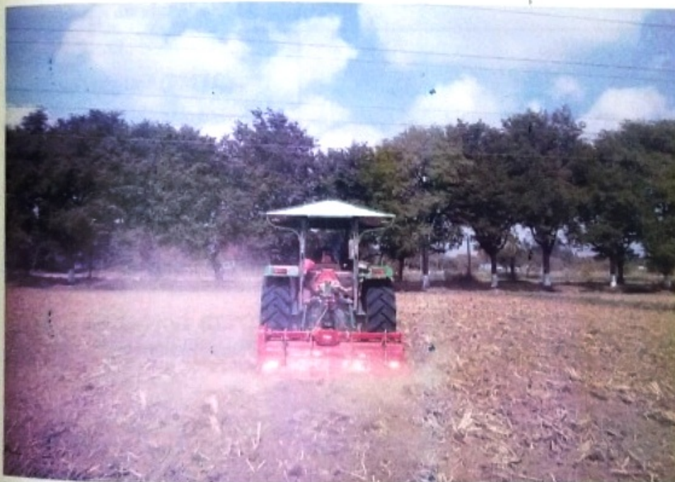
Fig.7. Field Test – Dry land

FARM MACHINERY TESTING CENTRE AGRICULTURAL ENGINEERING COLLEGE & RESEARCH INSTITUTE, TNAU, KUMULUR