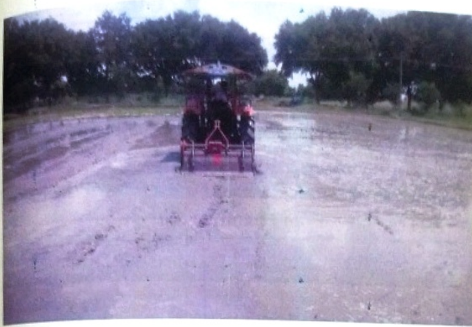
Fig.6. Field Test – Wet land