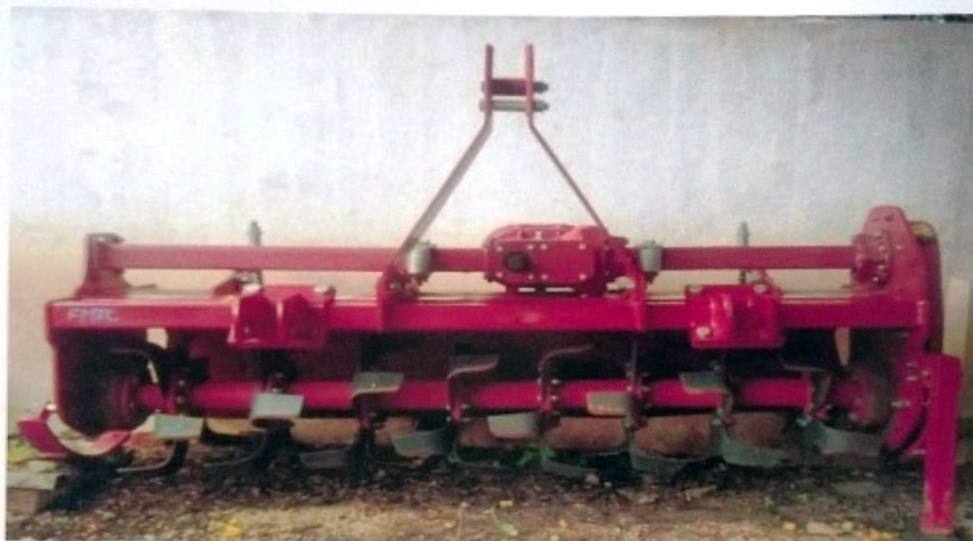
TAFE AGRISTAR 815DX – 48 BLADE MULTISPEED ROTARY TILLER