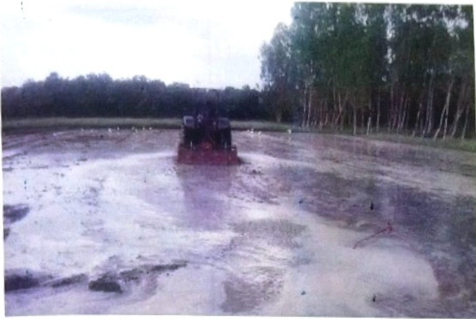
Fig.6. Field Test – Wet land