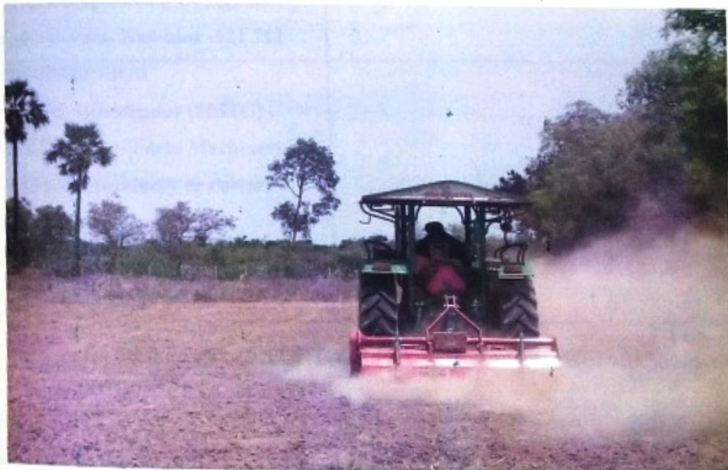
Fig.7. Field Test – Dry land

FARM MACHINERY TESTING CENTRE AGRICULTURAL ENGINEERING COLLEGE & RESEARCH INSTITUTE, TNAU, KUMMUR