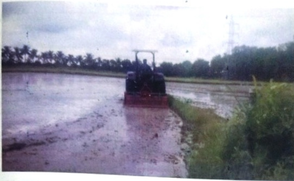
Fig.6. Field Test – Wet land