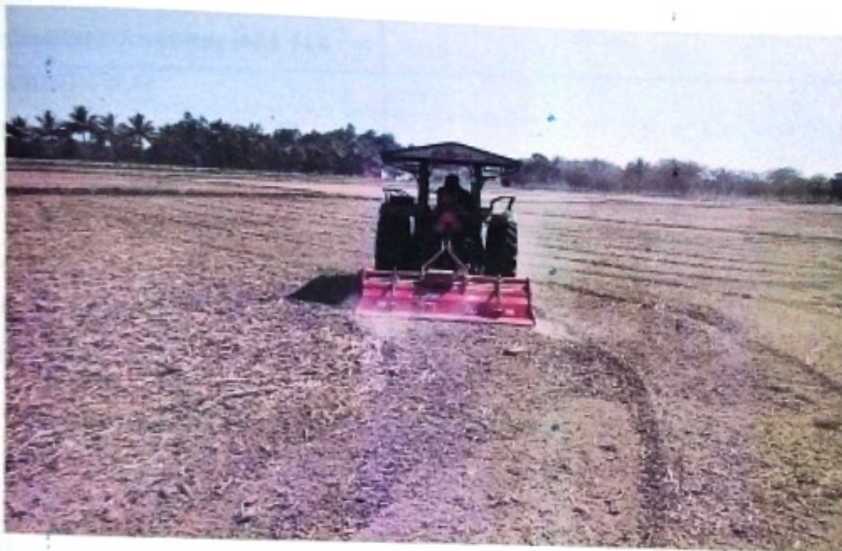
Fig.7. Field Test – Dry land