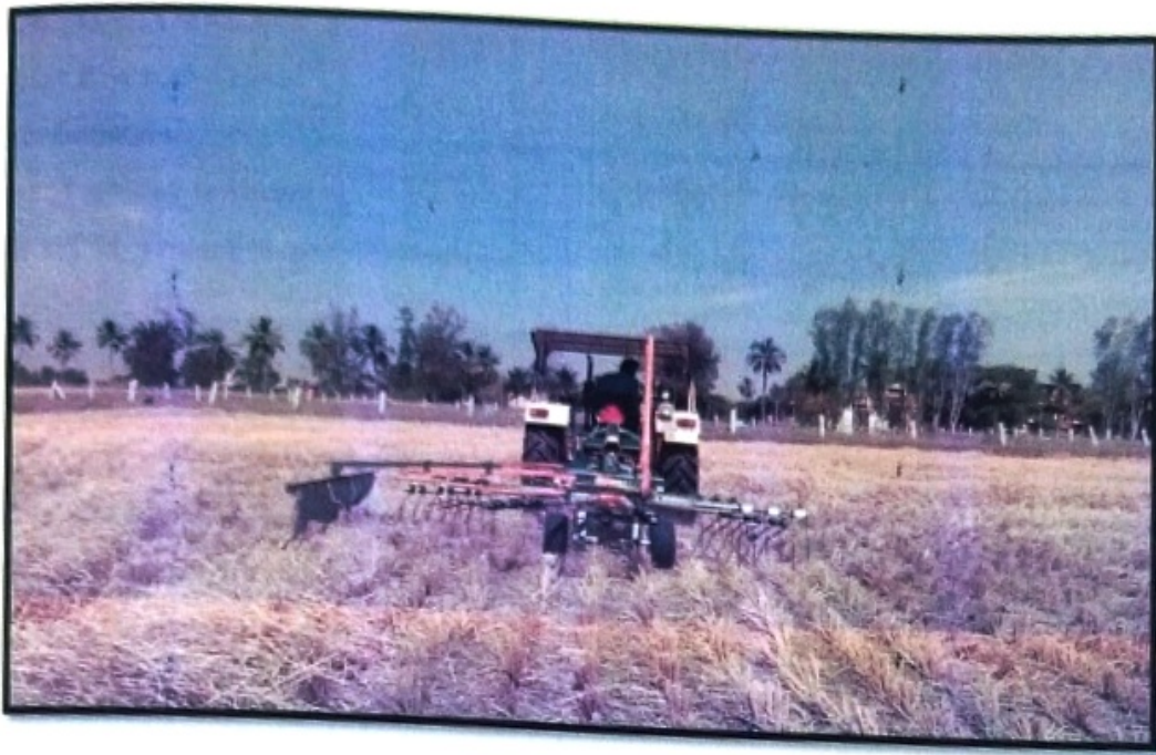
Fig.8: Before Field Test