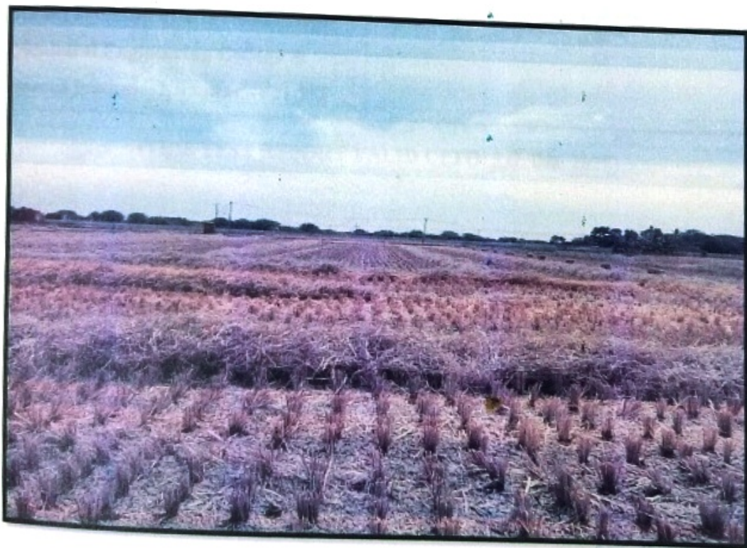
Fig.9: After Field Test