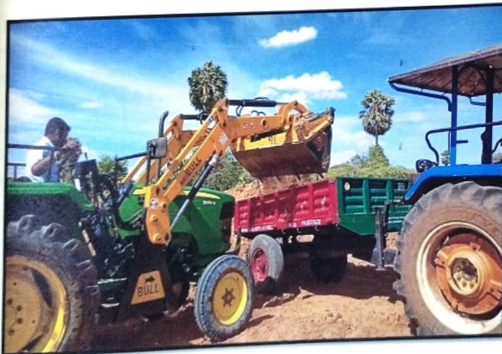
Fig.10: Field Test