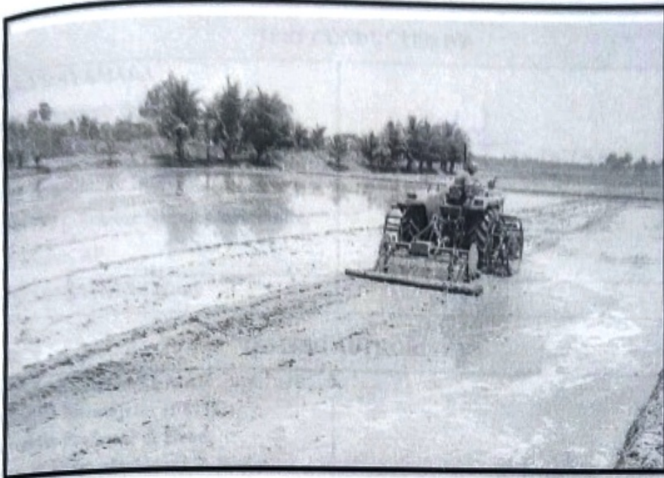
Fig.6: Field Test – Wet land