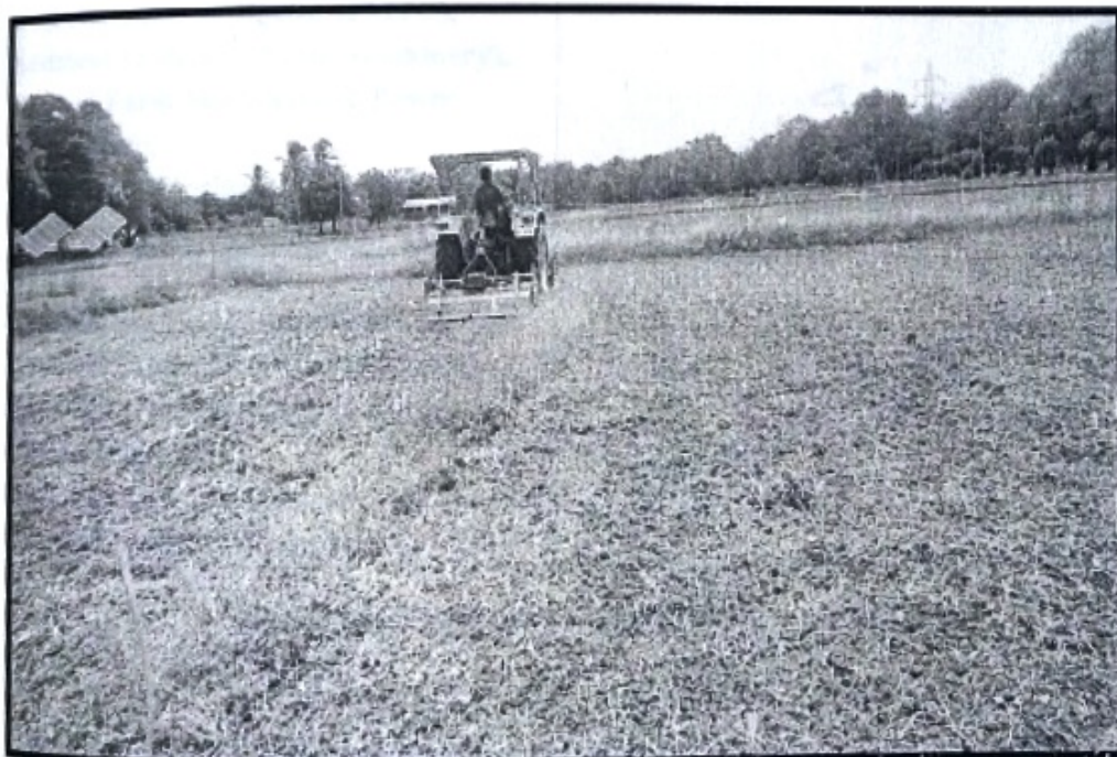
Fig.7: Field Test – Dry land