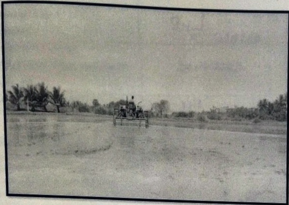
Fig.6: Field Test – Wet land