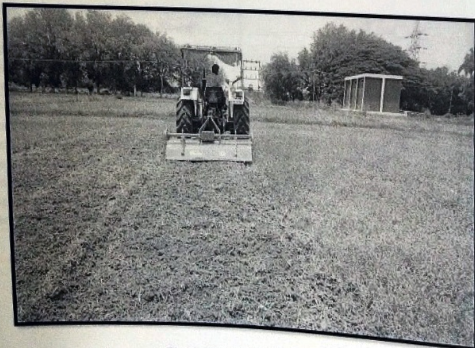
Fig.7: Field Test – Dry land