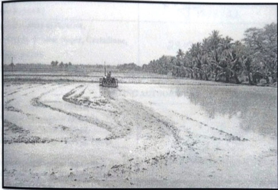
Fig.6: Field Test – Wet land