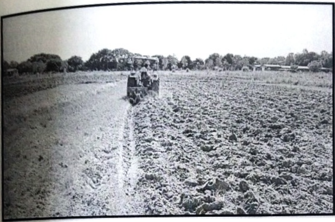
Fig.2: Field Test