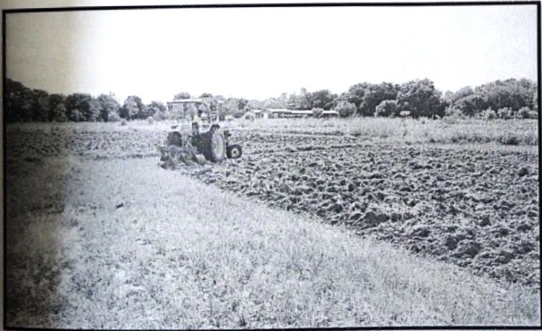
Fig.3: Field Test