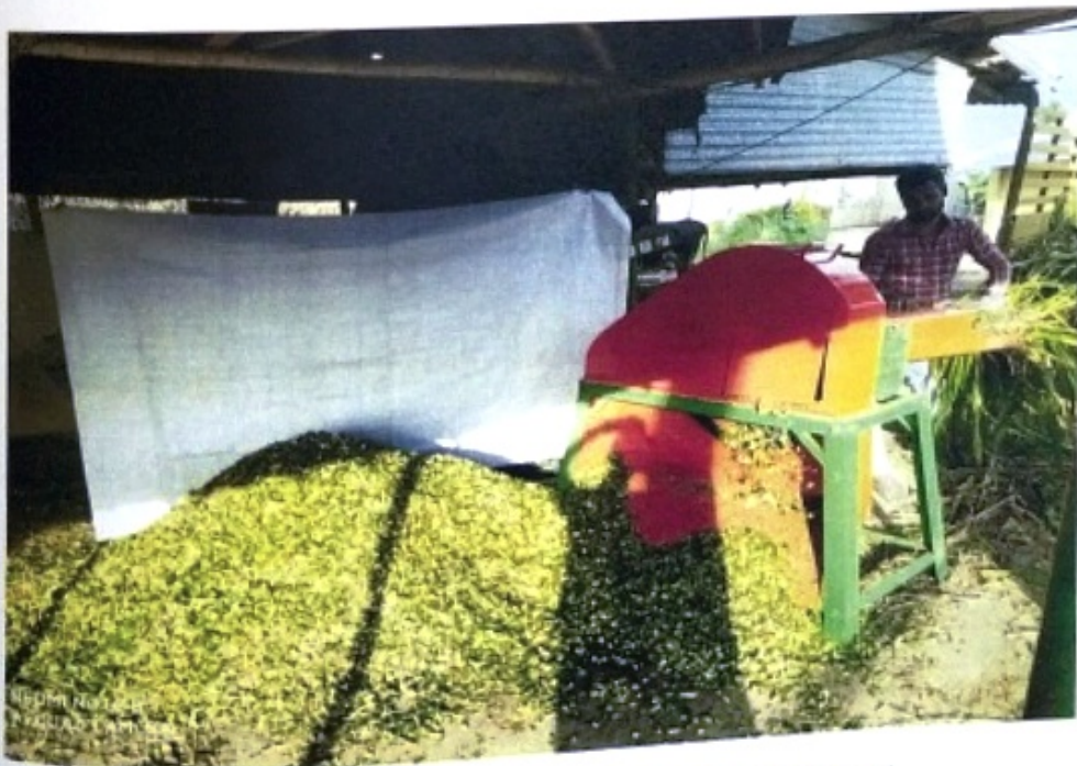
Fig. 5 Operational view of the chaff cutter (Wet crop)