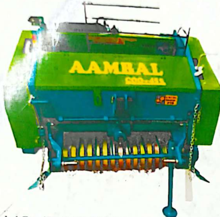
Aambal Coo 455-ROUND BALER (TRACTOR MOUNTED)

COMMERCIAL TEST REPORT (THIS TEST REPORT VALID UP TO: 09/09/2031)