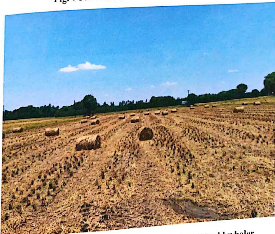
Fig.8 View of field after operation with bales formed by baler

FARM MACHINERY TESTING CENTRE DEPARTMENT OF FARM MACHINERY AND POWER ENGINEERING AGRICULTURAL ENGINEERING COLLEGE & RESEARCH INSTITUTE, TNAU, KUMULUR-631 712 TRICHY DISTRICT, TAMIL NADU.