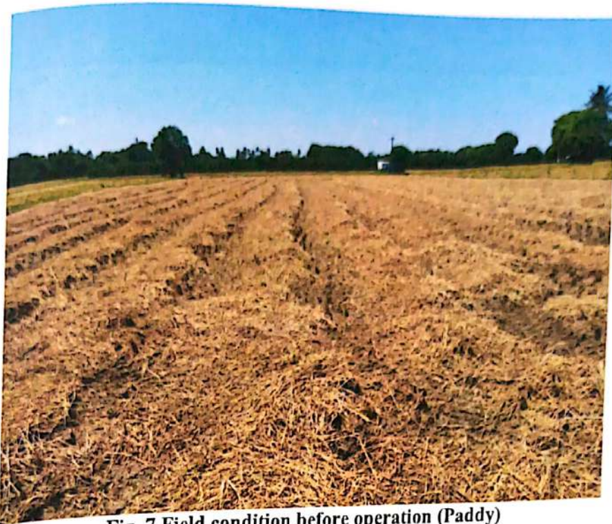
Fig. 7 Field condition before operation (Paddy)