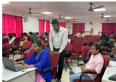
Hands on @Training Hall